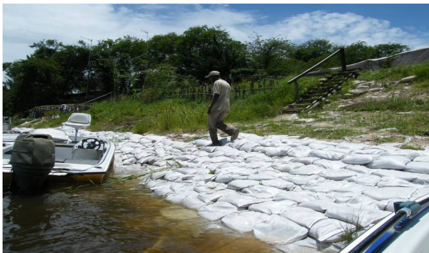
Sandbags in front of the Bar area