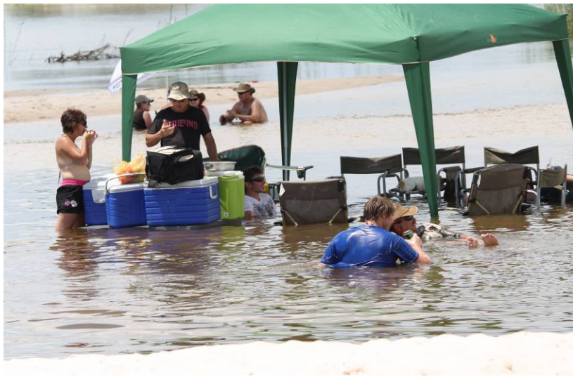
New years day just relaxing in the water

Once again we are busy packing bags on the river bank and this time round I know it won't be in vain. We putting a lot of work into this and slowly but surely I can see we are winning. I think if I started this when I got here it would have looked much different by now, but like they say you learn from your mistakes