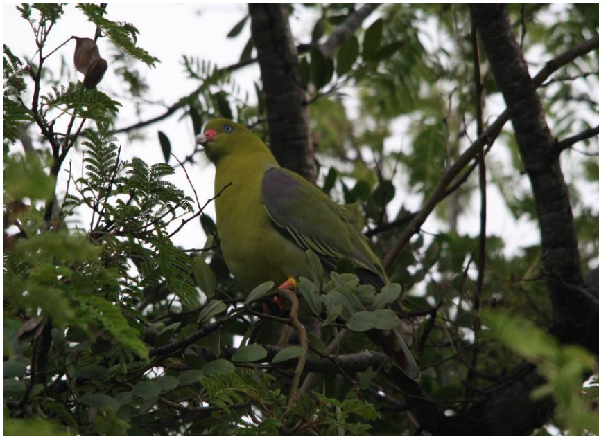
A Green Pigeon