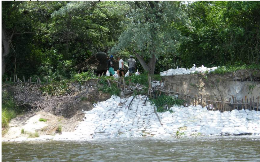
In front of Heron/ Kingfisher

Once again we are busy packing bags on the river bank and this time round I know it won't be in vain. We putting a lot of work into this and slowly but surely I can see we are winning. I think if I started this when I got here it would have looked much different by now, but like they say you learn from your mistakes